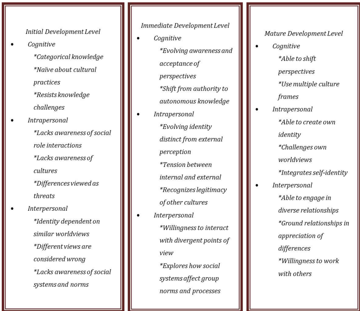
Figure 2. Intercultural Maturity Model (Spitzberg & Changnon, 2009, p.22).

with others of divergent points of view and recognizes the value of other cultures. The final development to be reached is the mature stage. The individual is able to consciously shift perspectives and uses multiple lenses to understand various points of view. She/he has developed a new identity and is willing and able to work with others from diverse perspectives. King and Baxter Magolda (2005) believe that the low levels of awareness and sensitivity represent less competent modes of intercultural interaction while higher levels of awareness and sensitivity represent more competent modes of intercultural interaction (Spitzberg & Changnon, 2009). As individuals progress through the maturity model they tend to interact more with people from other cultures. Figure 2 provides King and Baxter Magolda's (2005) model identifying the three levels of maturity for intercultural competence.