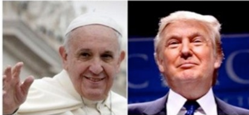
Figure 5: Screenshot of the fabricated news article published in July 2016 on WTOE5News.com (The site no longer exists).

TOPICS: Pope Francis Endorses Donald Trump