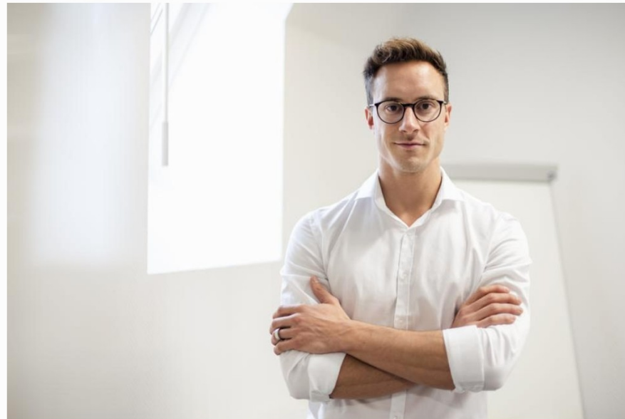
Portrait of confident young man

A friend of mine wanted to do an experiment on fake news. He published a Facebook post on his profile containing an image of