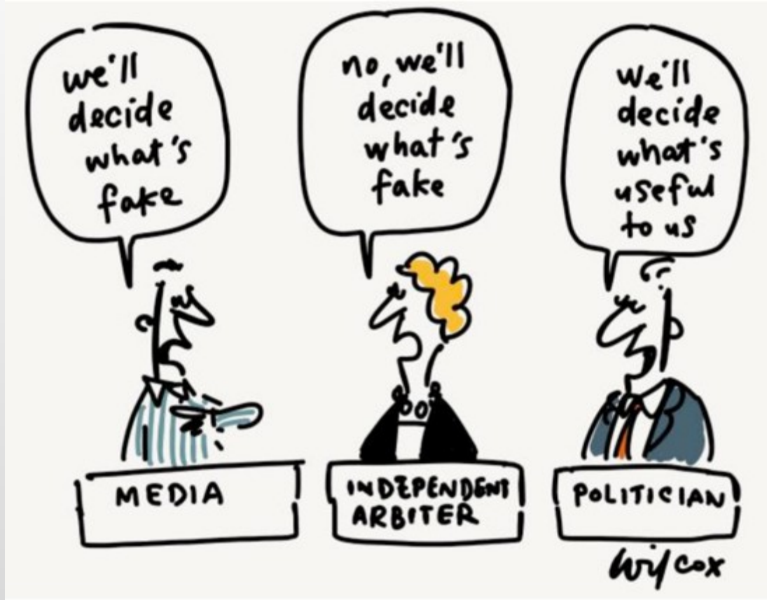
Cartoon by Cathy Wilcox, drawn for UNESCO for World Press Freedom Day 2017